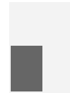
Quarter Page Vertical 124mm x 92mm