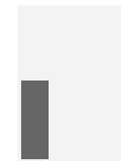
Eighth Page Vertical 124mm x 44mm